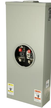
ABB Eco Solutions™

The Microelectric® BS225M Series of 225 A bi-directional rated meter sockets is designed to facilitate connections to two pieces of equipments, such as solar panels and load centers.