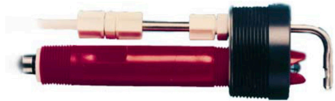
Figure 3 ABB TB556 pH Sensor with hydraulic cleaner