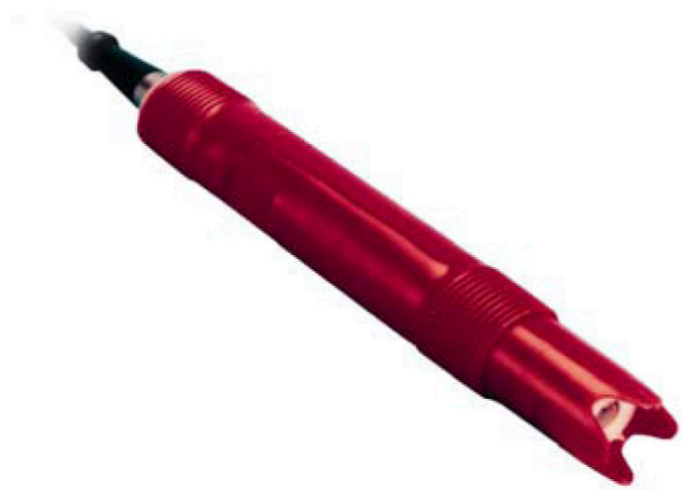
Figure 2 ABB TB556 pH Sensor