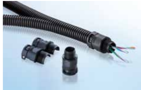
PMA Divisible System for retrofit and repairs.