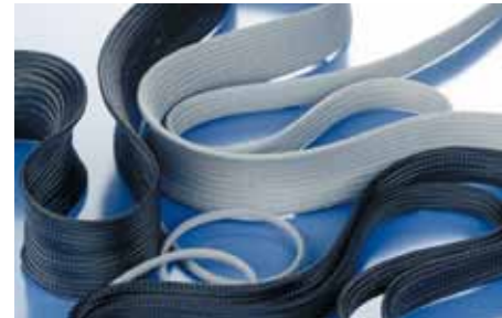
Braids F.66, C.66, L.66, F.PX, L.PX, G.PX for simple bundling and abrasion protection for cables and wires.