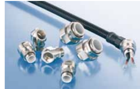
Accessories: Wide range available.