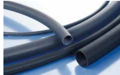
Conduits: PLR (PA6) and PCSL (PA12) conduits with high-grade, specially formulated polyamide. Very good flammability characteristics and mechanical performance.