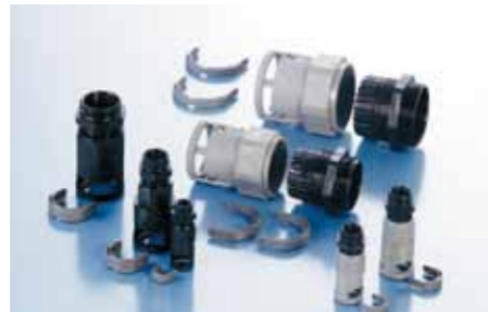
Fittings: PMAFIX IP68GT single piece fittings with integrated strain relief optimally holds and seals cables.