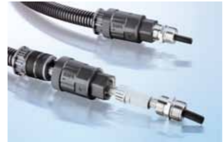
PMA EMC System providing electro-magnetic shielding.