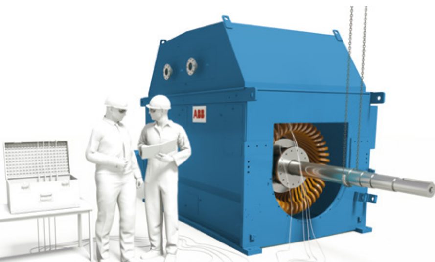
ABB Ability™ Predictive Maintenance optimizes the maintenance of high voltage 4- and 6-pole synchronous motors and generators (AMS and GBA). Taking a condition-based approach, it combines customer input with advanced analytical techniques to create the optimal maintenance program. This ensures that the right service actions are taken at the right time and for the right reasons.

Higher uptime with optimized maintenance planning