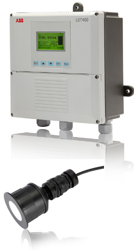
Fig. 3: LST400 ultrasonic level transmitter