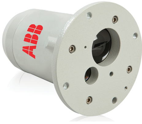
Fig. 2: LM80 laser level transmitter