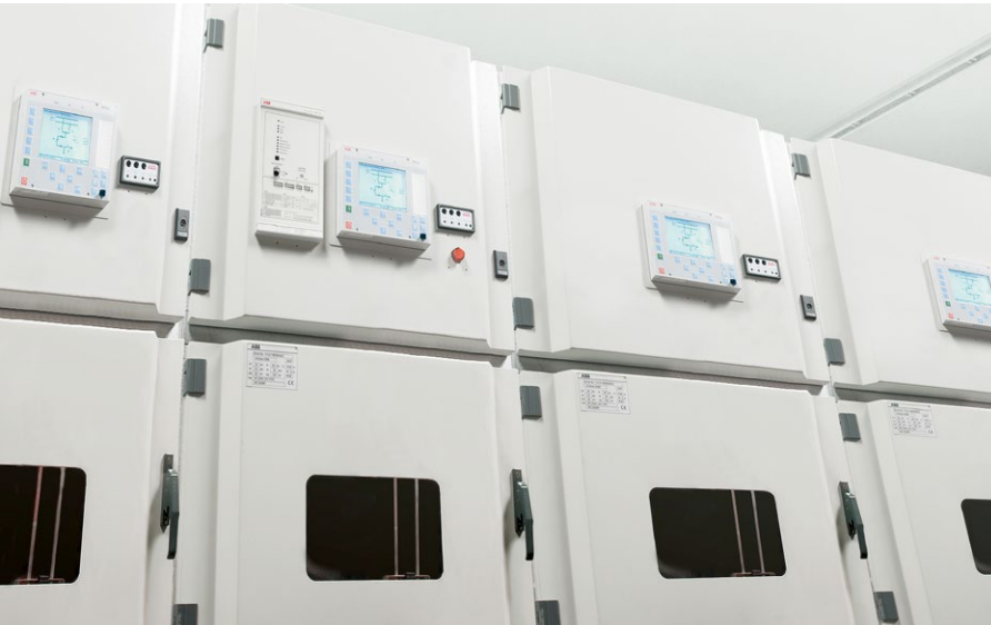
— The 630 series IEDs and REA arc protection system were installed in ABB's Unigear switchgear.