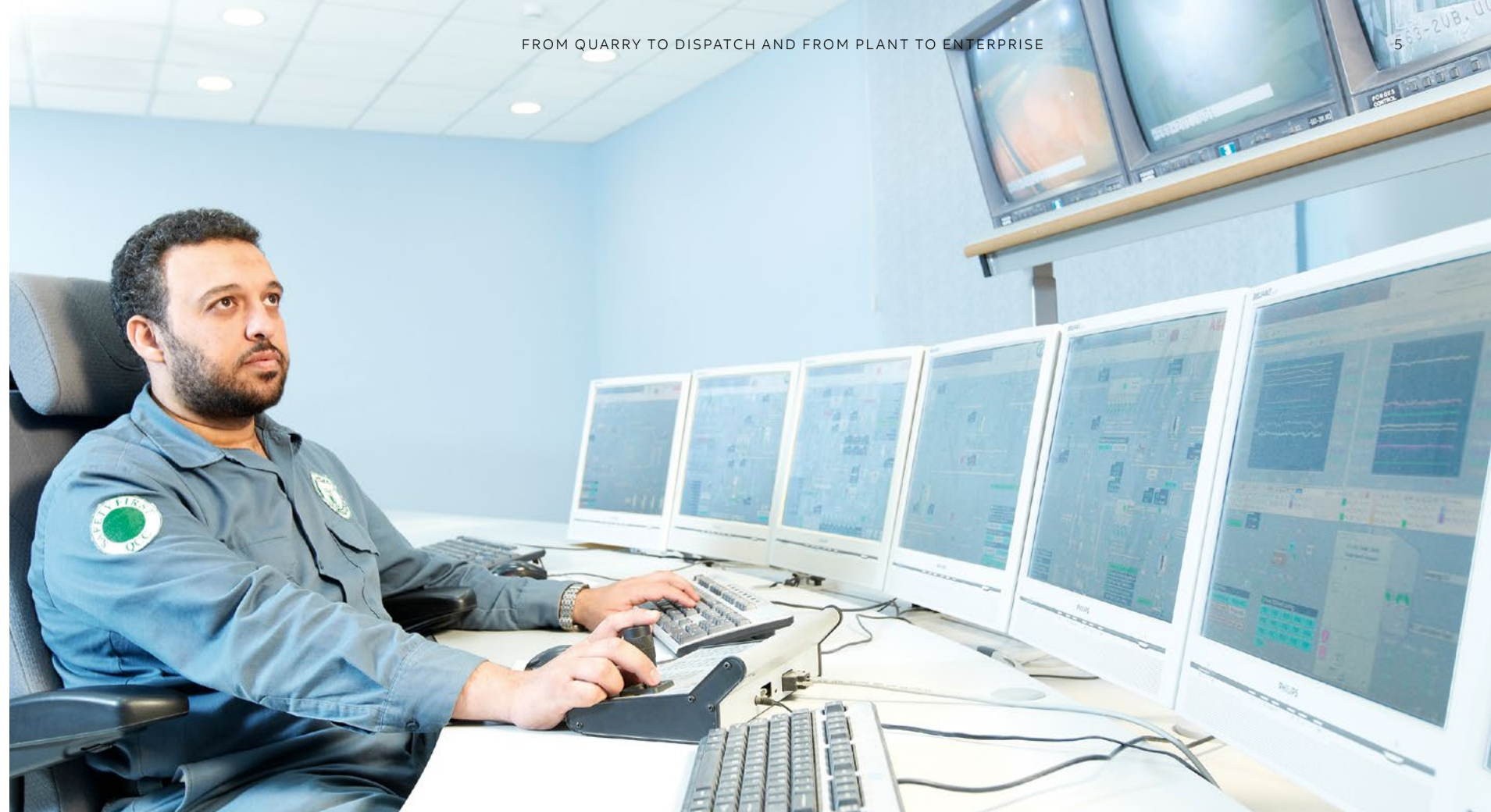
ABB provides a wide range of instrumentation products for cement industry processes such as continuous gas analyzer systems for process gas measurements, emission monitoring, online measurements for bulk materials, as well as instrumentation for other specific applications.

Unrivalled in its scope and applications expertise, ABB is a global leader with solutions certified to international standards and a world-wide network of manufacturing plants.