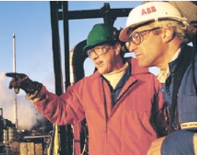
Maintenance, repair, spare parts and installation service