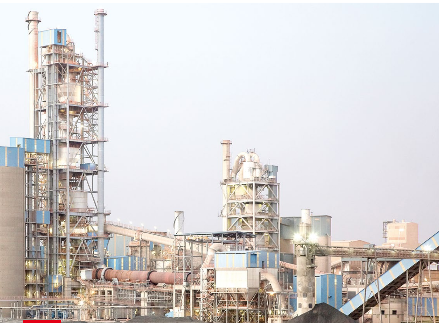
ABB in cement manufacturing

From quarry to dispatch and from plant to enterprise