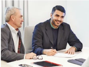
Project management and engineering for complete electrical system integration