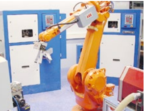
Integration of robots