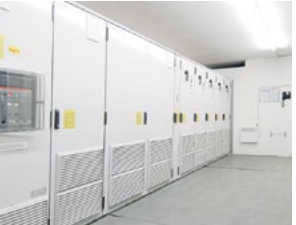
AC multi-drives/AC single-drives