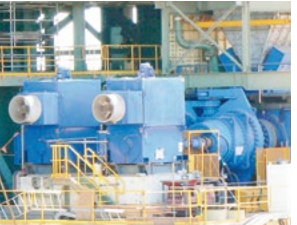
Variable speed drives for high pressure grinding rolls applications