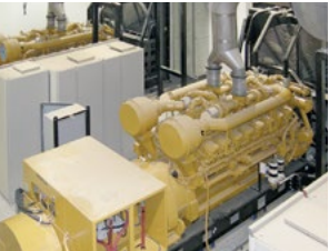
Emergency power generation and UPS