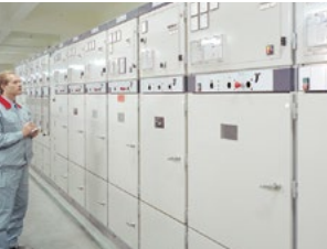
Motor control centers