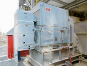
AC motors and complete AC drives systems