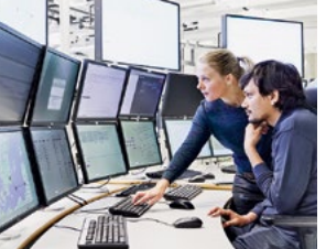
Automated integration of process data with business systems for effective management