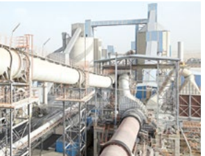
Process optimization systems for maximizing production, optimizing quality and minimizing production costs