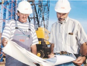
Infrastructure: Grounding lightning protection, lighting systems, cabling, communications systems and fire protection