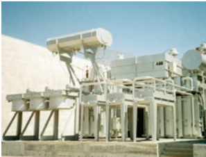
Transformers, switchgear, static var compensators and harmonic filters