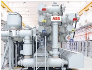
Gas insulated switchgear and industrial substations