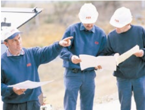
Site management, installation supervision and commissioning services