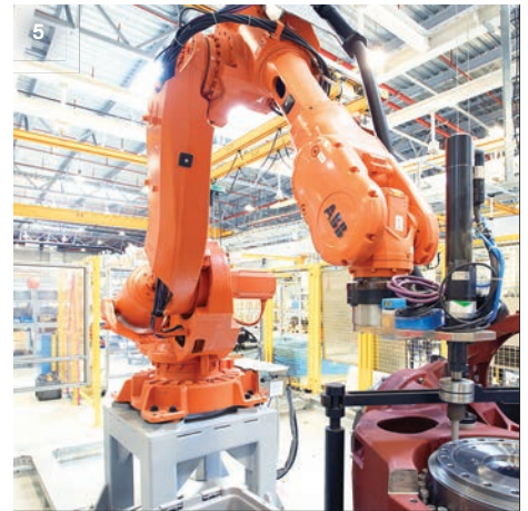
1 Power products | 2 Power systems | 3 Low voltage products | 4 Process automation | 5 Discrete automation and motion