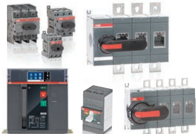
ABB has a reputation for manufacturing and supplying quality low voltage components, the result of our on-going research and development programme.