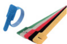
FO series loop ties