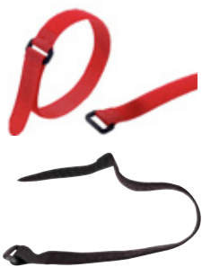
FOL series buckle ties