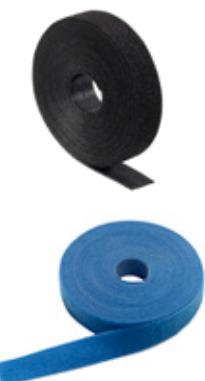
FOR series rolled hook and loop