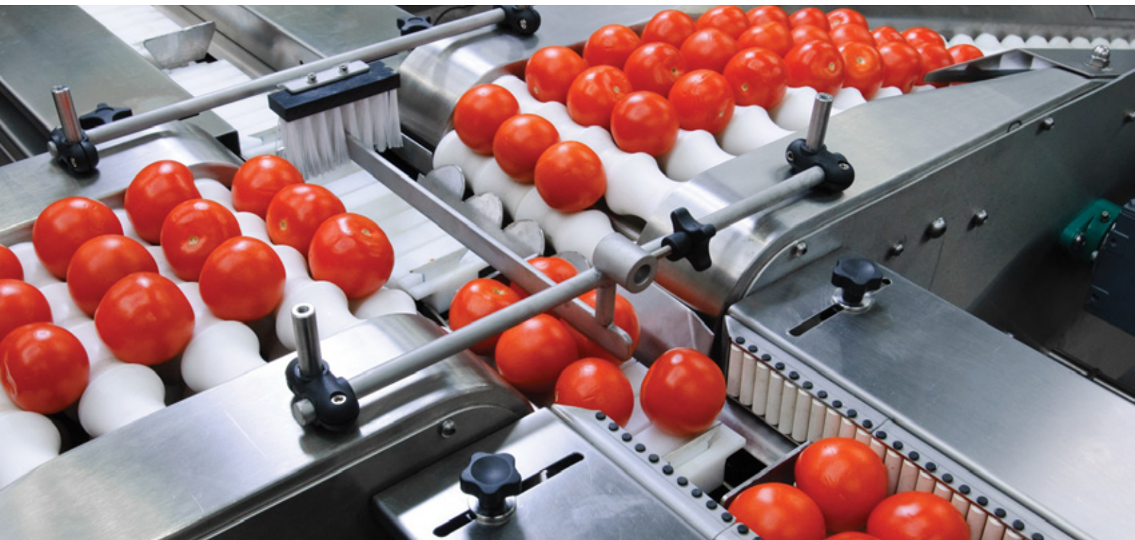
ABB has a long experience of developing safety products and solutions adapted for the harsh environment and requirements of the food and beverage industry.