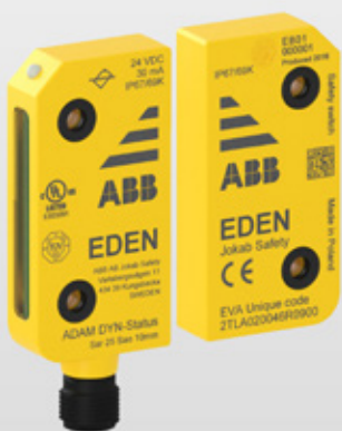
ABB Jokab Safety Products