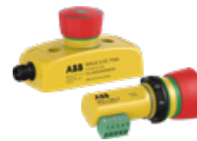
Smile/Inca Emergency stop Compact design and easy to install. LEDs provide diagnostics.