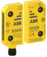
Eden Non-contact sensor Easy to install, highest level of safety and high reliability.

With a wide range of sensors and control devices, ABB Safety Products has suitable safety solutions to most safety functions for machine builders and OEMs.