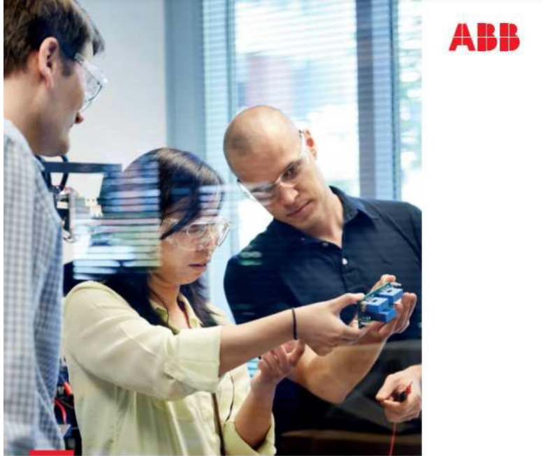
ABB Supplier Code of Conduct

The ABB Supplier Code of Conduct defines the main principles underlying