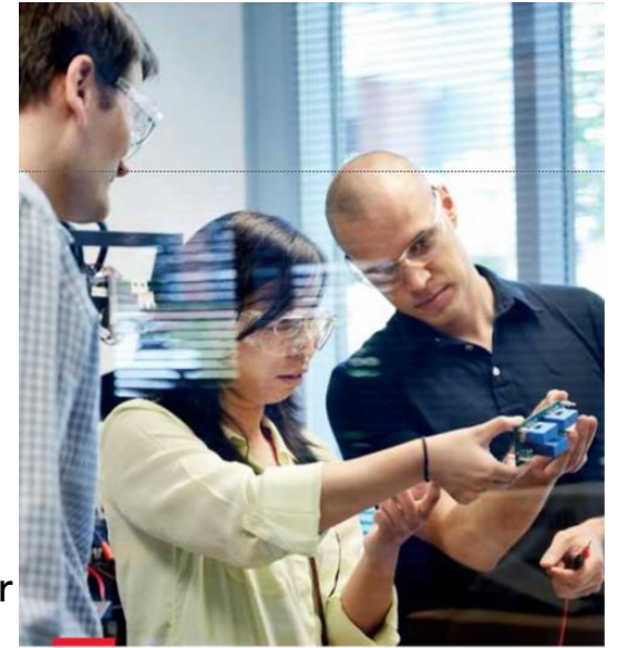
ABB Supplier Code of Conduct