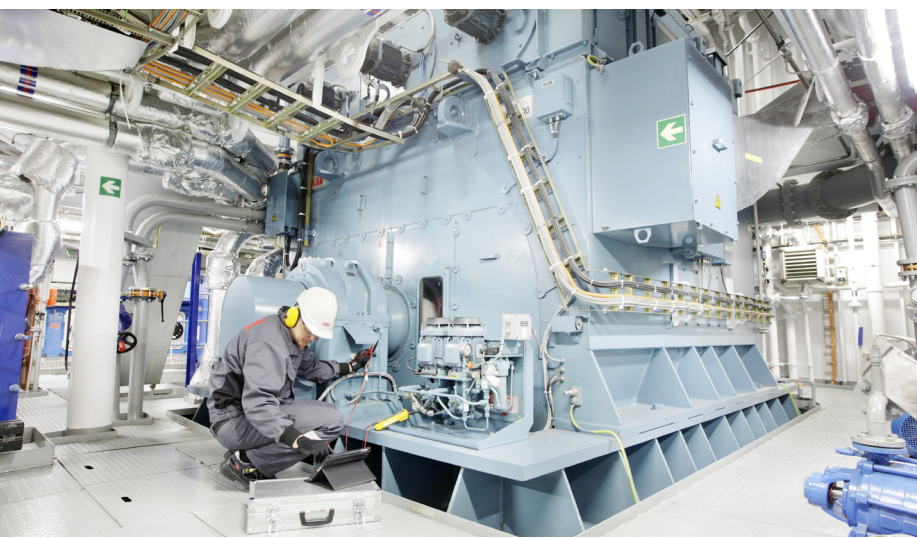
ABB offers a full range of onsite Motor and Generator Field Services, with an experienced Field Service Team available 24/7, to help keep your operations up and running or minimize disruption to operations during an emergency outage.

Keep operations running and minimize downtime