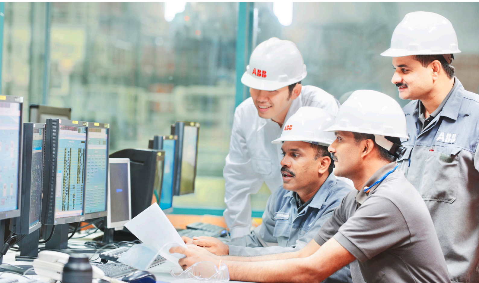
ABB is a leading global engineering company that energizes the transformation of society and industry to achieve a more productive, sustainable future. By connecting software to its electrification, robotics, automation and motion portfolio, ABB pushes the boundaries of technology to drive performance to new levels. With a history of excellence stretching back more than 130 years, ABB's success is driven by 144,000 talented employees in over 100 countries.

The authorization program is a procedure to guarantee that the services the customer receives from the ABB Value Providers are on the same leading level as the quality of the ABB products, both globally and locally. Once certified as ABB authorized channels, our partners have indepth knowledge of local markets and are conversant with the defined ABB products and processes.