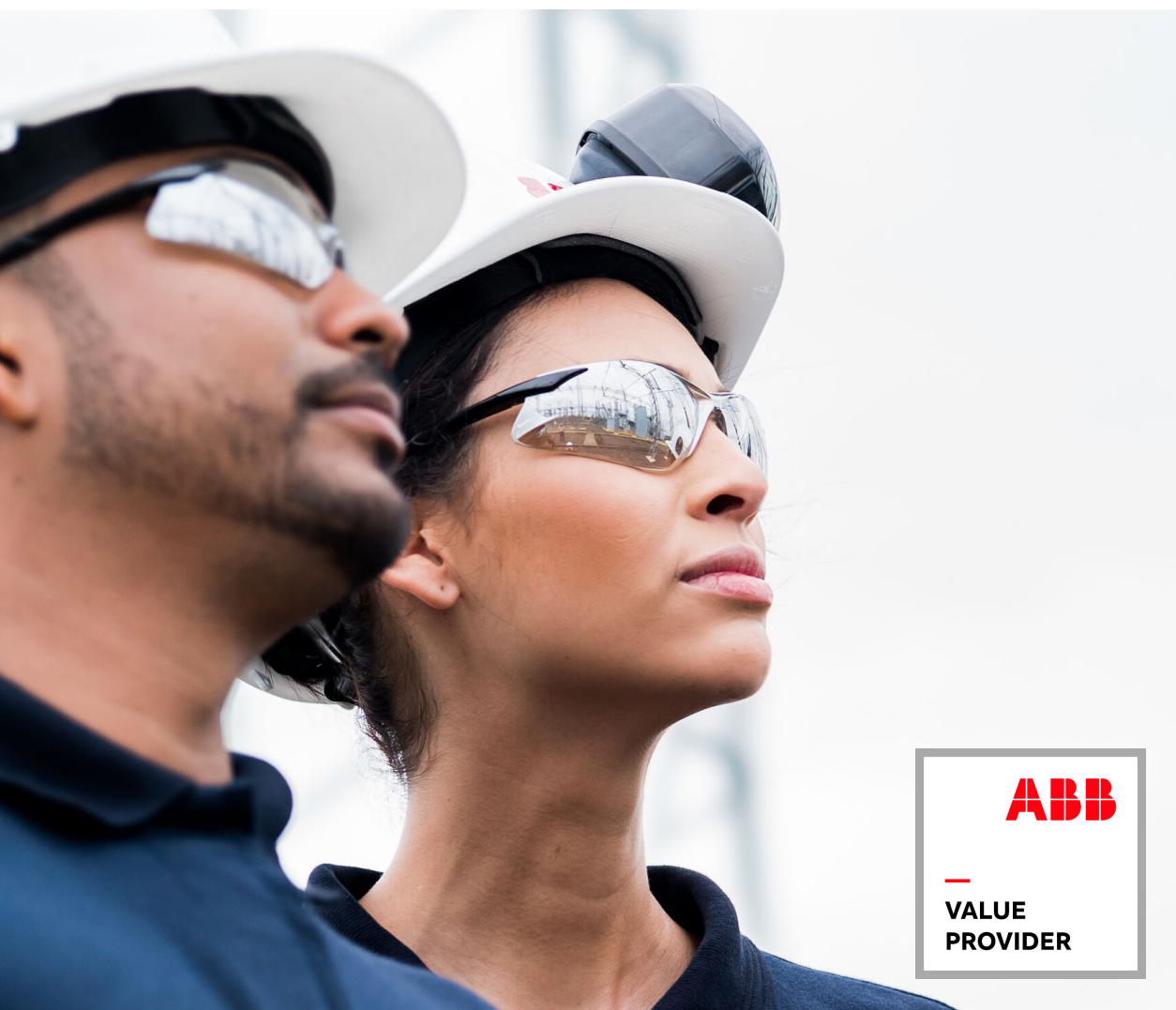
ABB Value Provider Program for control systems