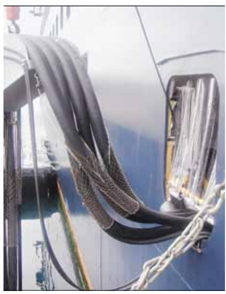
4 Connection cables on Holland America Line's Vista-class ms Oosterdam vessel

The IEC, ISO and IEEE joined forces to create a standard that will enable onshore power connections to effectively have a water-tight global basis.