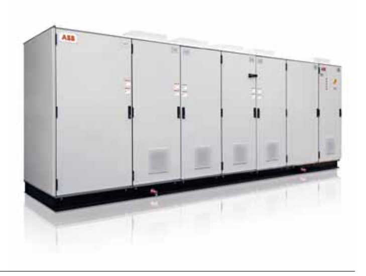
a ABB's PCS100 static frequency converter

ship power connections: 11 or 6.6 kV as required by the ship.