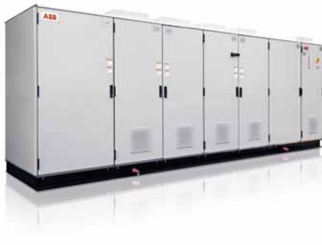
b ABB's PCS6000 static frequency converter

ship power connections: 11 or 6.6 kV as required by the ship.