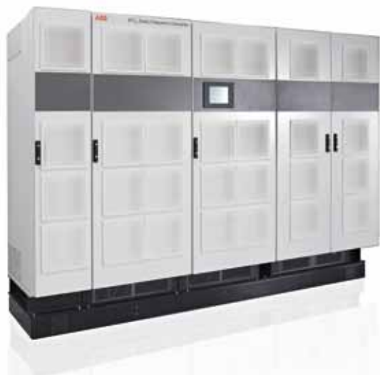
a ABB's PCS100 static frequency converter