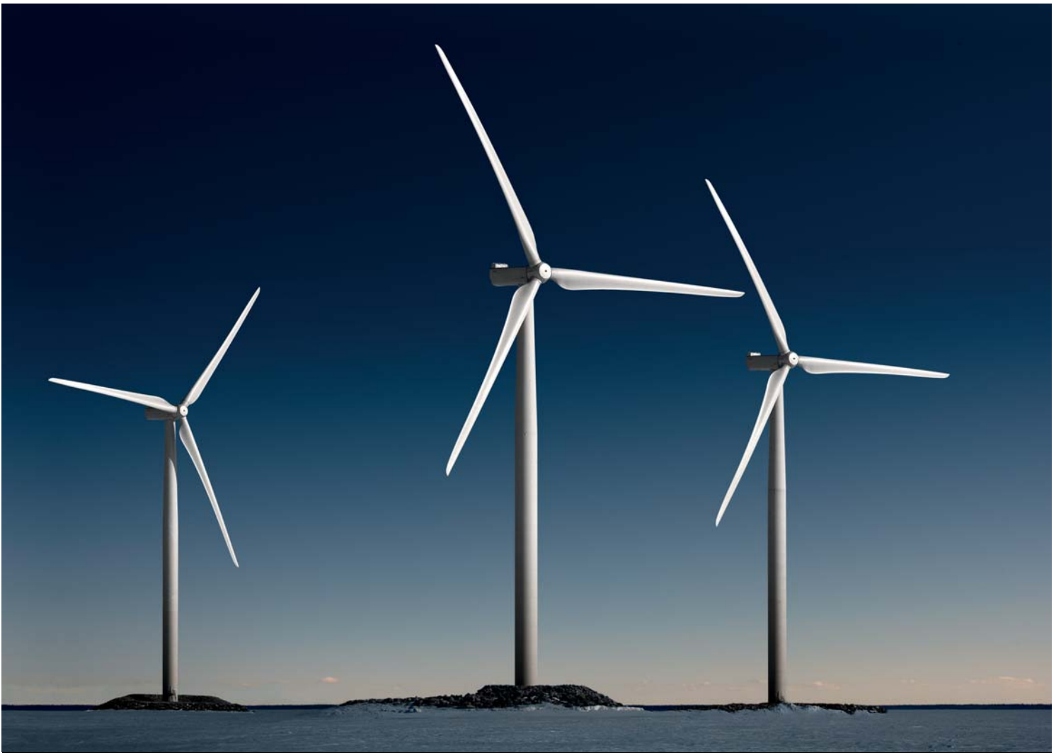
ABB Wind Care Service Offering