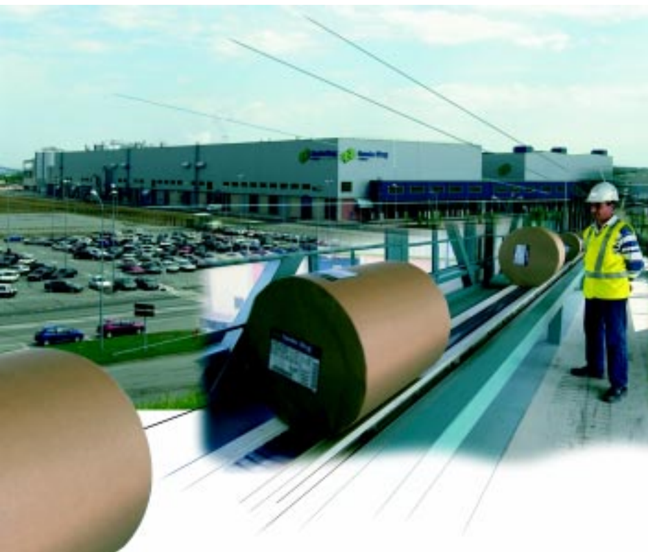
ABB plays a lead role in Norske Skog's successful investment in Golbey, France

One of the most profitable wood-processing companies in the Nordic countries, the Norwegian Norske Skog is investing heavily in international growth. Apart from its mills in Norway, Norske Skog has printing-paper mills in France, Austria and the Czech Republic. It also has a noteworthy 33 % interest in the Pan-Asia Paper Company (PAPCO) operating on the Asian market, and production facilities in Korea, Thailand and China.