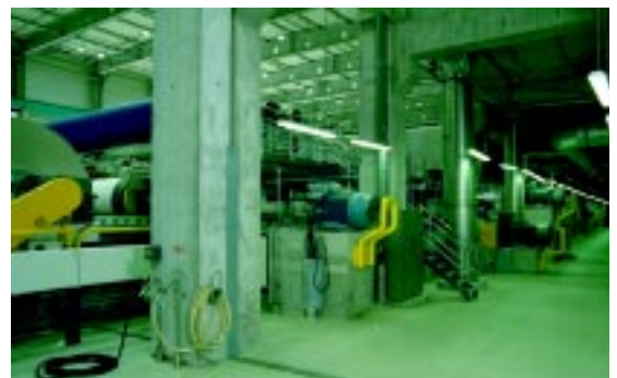
The system included 47 motors ranging in power from 37 kW to 1690 kW.

ABB's PMC 200™ drives combine the advantages of applications, motors, frequency converters and versatile services. The AC drives supplied by ABB were the first in Europe to incorporate ACS 600 MultiDrive frequency transformers based on IGBT technology with Direct Torque Control (DTC). Another first were the new water cooled AMA motors manufactured by ABB Industry Oy's Machines group, which were installed in addition to the standard motors. The AMA motors have a considerably higher power rating than HXR motors.