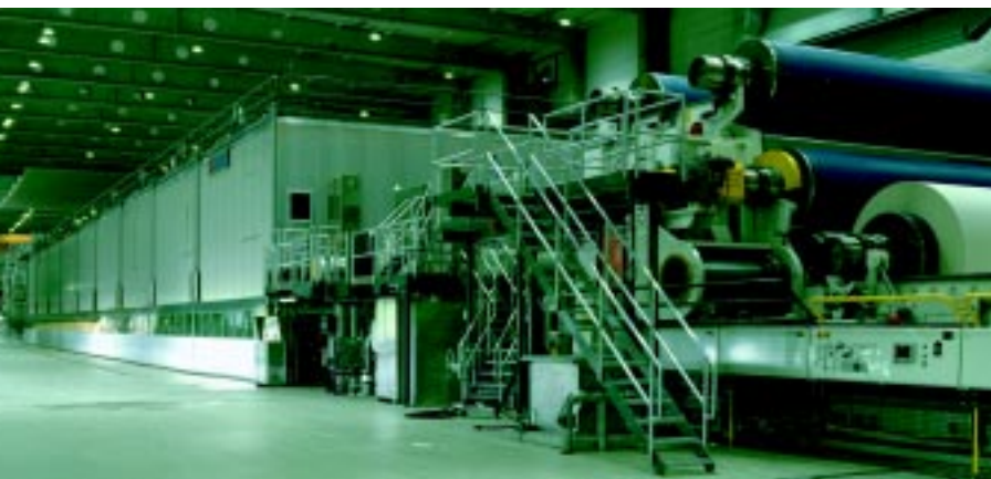
With a speed of 1800 m/min, the PM2 is the fastest in the world in its class.