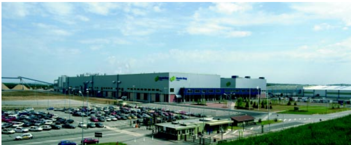
The Norske Skog, Golbey produced 600,000 tonnes of newsprint per year.