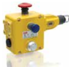
Emergency rope pulls