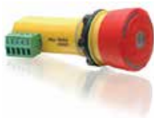
Panel emergency stops