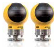
Two hand controls