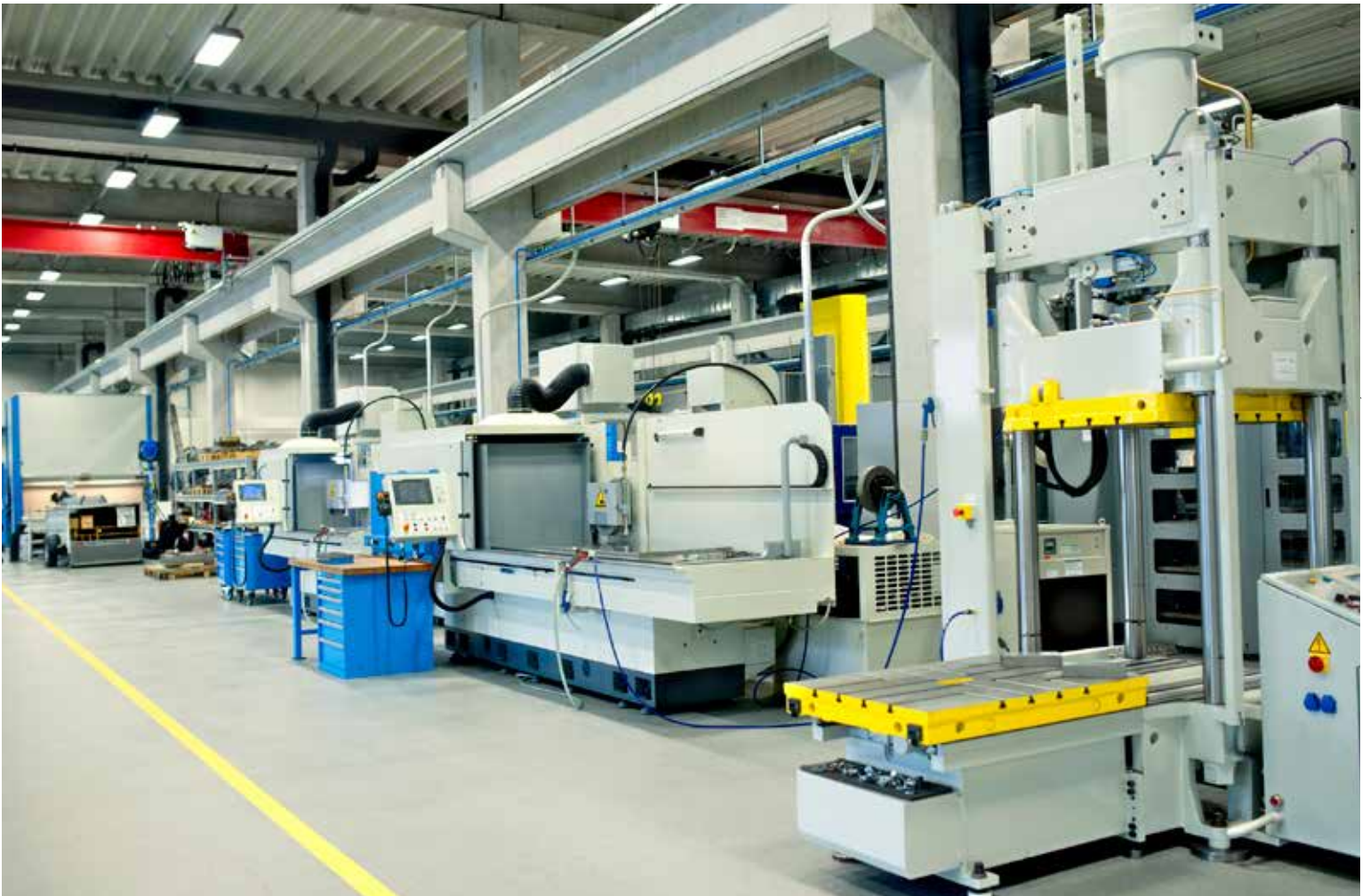
ABB JOKAB SAFETY Protecting your valuable personnel and your company bottom line