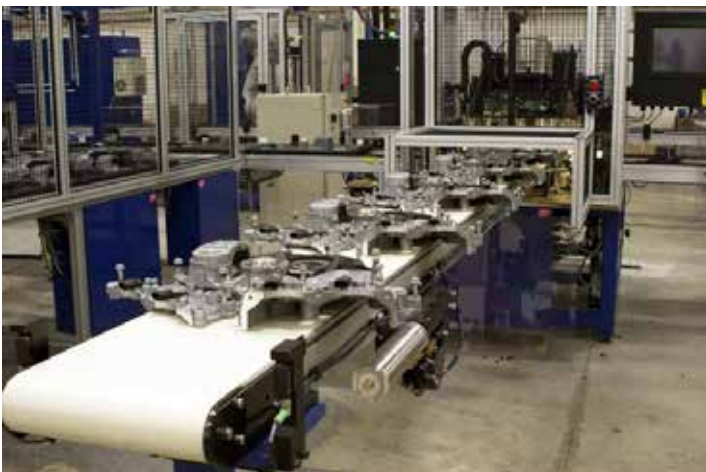
ABB JOKAB SAFETY methodology for machine safety not only applies to new custom designed machines and processes, but to upgrades to existing machinery as well, and we take into account all modes of operation. This creates a safety system that enhances rather than restricts production, thus creating value with "Production Integrated Safety Solutions" for our customers.

From the beginning of every design, ABB JOKAB SAFETY machine safety solutions are properly adapted and executed to meet your specific needs, and increase productivity. ABB JOKAB SAFETY wants to help you further your company's safety culture and increase workplace safety. Our engineered complete solutions are integrated into your process to enable a production friendly safety environment.