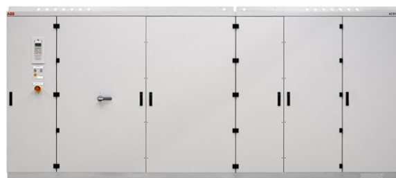
ACS1000 water cooled