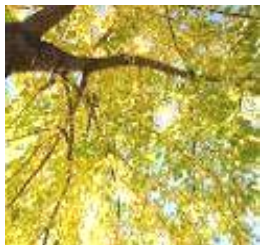
ABB is committed to attracting and retaining dedicated and skilled people and offering employees an attractive, global work environment.