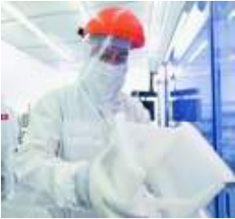
ABB helps customers improve their operating performance, grid reliability and productivity while saving energy and lowering environmental impact.