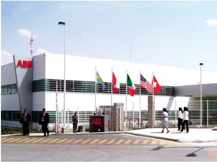
ABB in Mexico History