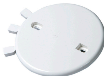
02 AK1.1 White cover for junction box

White covers for junction boxes get a new black addition.