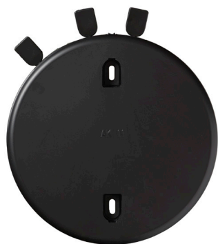
01 AK1.1M Black cover for junction box