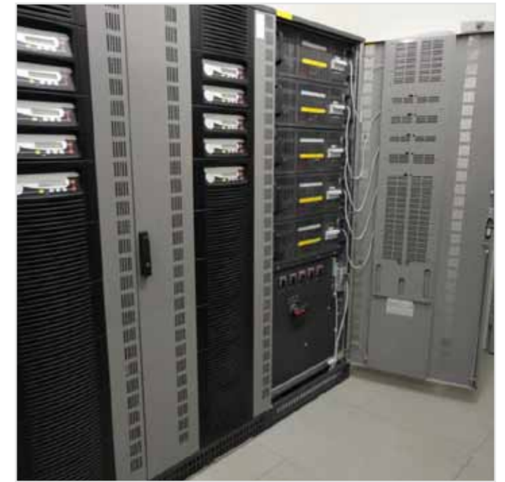
Installation of six Conceptpower DPA systems, each with 5 × 50 kVA/40 kW modules in the OIZ datacenter

The effort to increase efficiency, flexibility and availability is the key to the development and introduction of modular UPS solutions. The scalability of the modular architecture can significantly reduce the high levels of power consumption and CO 2 emissions, thus helping the planners to produce flexible scenarios for power and space requirements for the immediate and changing future requirements. ABB provided the best solution to the demanding requirements for the OIZ Hagenholz and installed six compact and modular Conceptpower DPA (Decentralised Parallel Architecture) systems, each with 5 × 50 kVA/40 kW modules in the OIZ datacenter. The battery packs were fitted separately. This makes sense, as the cooler the batteries