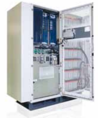
The PCS100 UPS-I has a 99 percent efficiency rate making it a reliable option for the electronics world