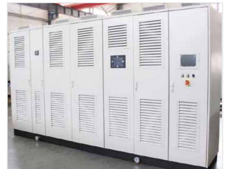
ABB’s 2 MW PCS100 ESS that will help complete the energy storage function with Prudent Energy

Prudent’s VRB is an energy battery offering supply over many