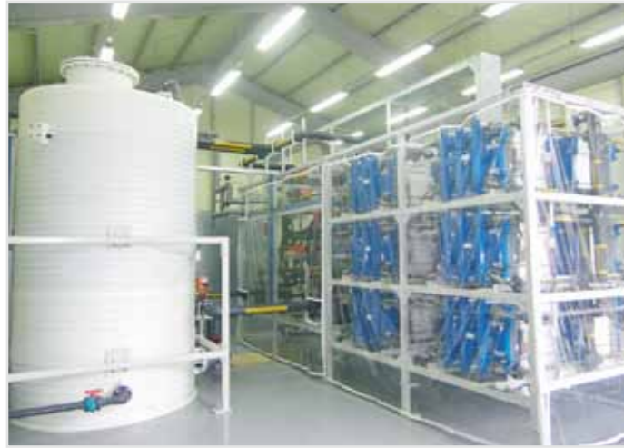
ABB's PCS100 ESS and Prudent's VRB Energy Storage System that has been installed on Jeju Island located in between Korea and Japan

ABB's PCS100 Energy Storage System (ESS) is grid code compliant and allows increased penetration of wind and solar power.