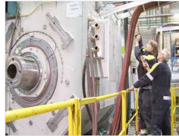
Teamwork of generators and converters

ABB's compact PCS 6000 represents a quantum leap in high power technology, particularly in terms of technical performance and economic operation. Furthermore the high efficiency and low maintenance lead to low operational costs.