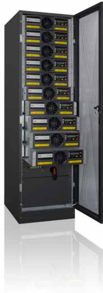
ABB develops, manufactures and markets technologically advanced UPS Systems for critical electronic devices and systems.

With a footprint of only 0.42 m 2 , the DPA UPScale ST 200 takes up less floor space than alternative UPS solutions, while still, at up to 472 kW/m 2 , providing unparalleled maximum power density as well as all the benefits of a modular DPA UPS solution.