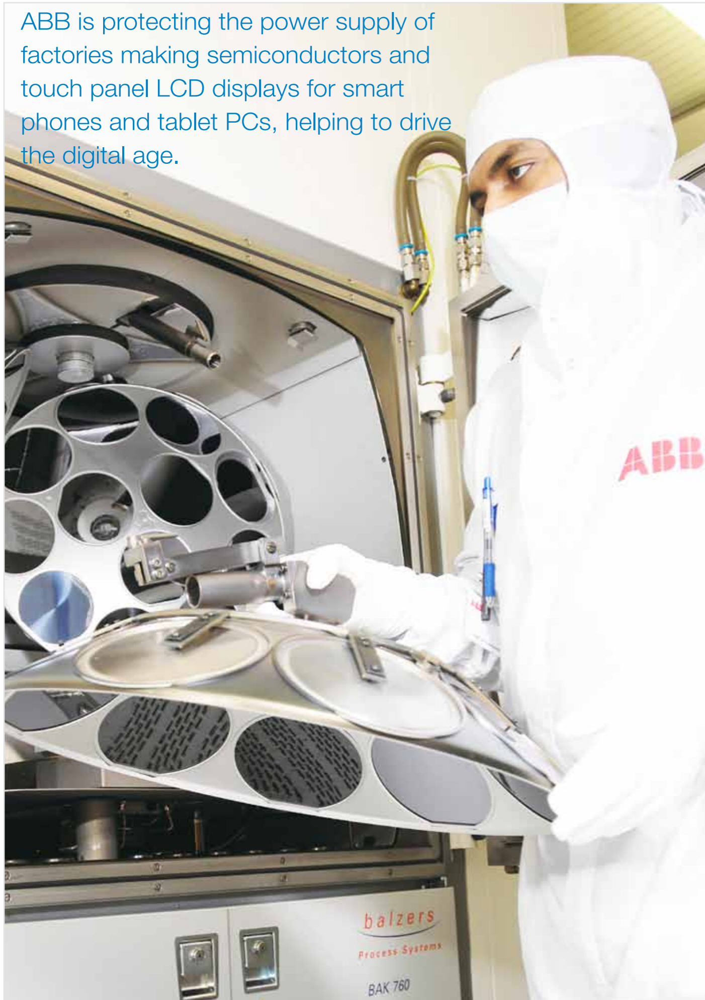
ABB is protecting the power supply of factories making semiconductors and touch panel LCD displays for smart phones and tablet PCs, helping to drive the digital age.