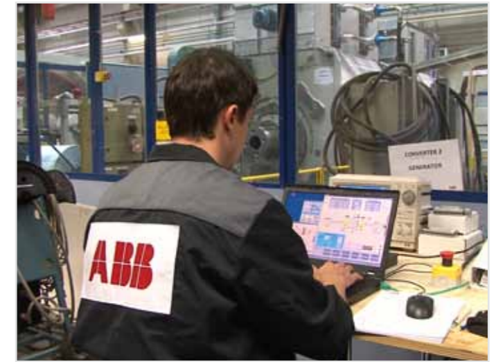
Test engineers in the Helenski test field

The back-to-back tests of the electrical drivetrain therefore showed that the generator-converter package met the customer's specifications and IEC requirements. This solution's combination of medium speed and medium voltage now provides many significant benefits, not only for the customer, the turbine manufacturer, but also for the wind farm operator and end-customer. MS PMGs pro-