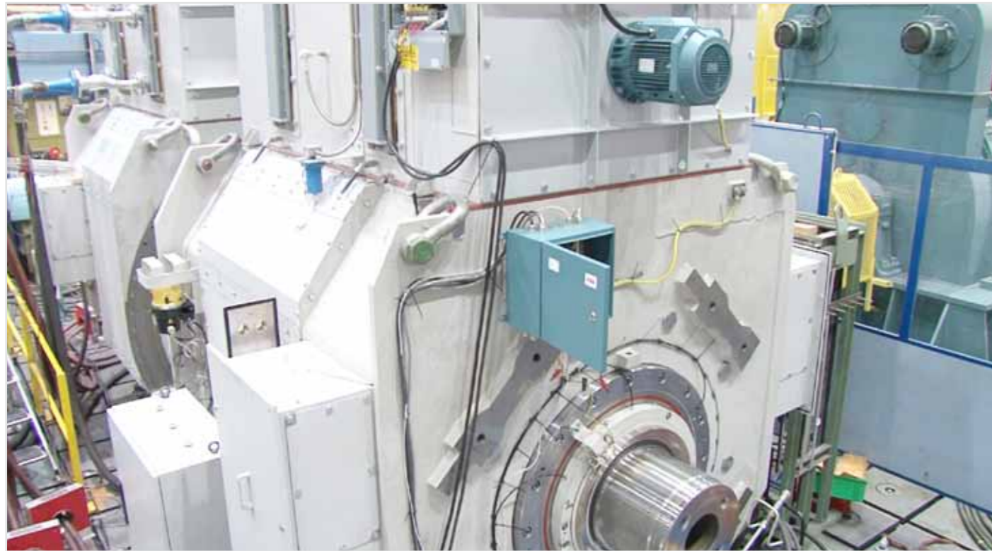
Two ABB medium speed permanent magnet generators in the back-to-back test set-up

Medium speed permanent magnet generators (MS PMGs) deliver more than 98 percent efficiency – the highest of any commercial wind generator design. Efficiency is also high at partial loads in low wind conditions, enabling the optimum annual production of kWh. This article spotlights the design and testing effort behind ABB's multi-MW medium speed and medium voltage generator-converter package.