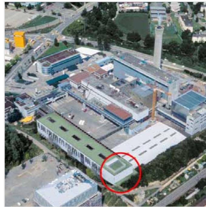
OIZ Hagenholz: Organization and Information Technology Center for the city of Zurich

ABB Switzerland supplies six Conceptpower DPA units to the City of Zurich.