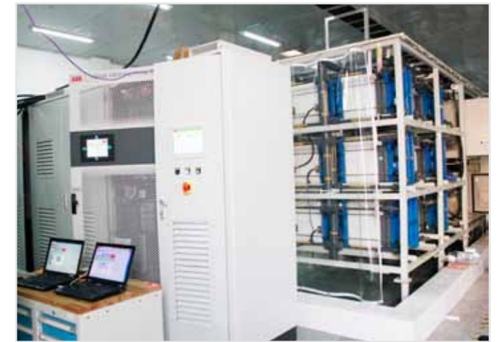
The complete solution of ABB’s PCS100 ESS paired with Prudent’s VRB Energy Storage System

To maintain efficient transmission and distribution, the active and reactive power balance in a system needs to be controlled. Inadequate active and reactive power management can result in high network losses, equipment overloading, unacceptable voltage levels, voltage instability and even outages. ABB and Prudent Energy have provided a turnkey solution incorporating ABB’s 100 kW PCS100 ESS, PLC (programmable logic controller) system, transformer and circuit breaker with Prudent Energy’s specialized VRB battery to a pioneering microgrid customer in Slovakia. Prudent Energy is the designer, manufacturer and integrator of the patented Vanadium Redox Battery (VRB®) Energy Storage System – a long-life, environmentally friendly “flow battery” system. Prudent’s technology integrates smoothly with ABB’s PCS100 ESS as it works by charging the VRB battery and regulating the power flow by discharging power to the grid when wind and solar energy output varies, and during unstable events, such as extreme weather conditions. After many tests, ABB’s power protection team in China provided a new solution for Prudent’s VRB battery to solve the problem of initial charge. The end result was an improved solution based on past projects with