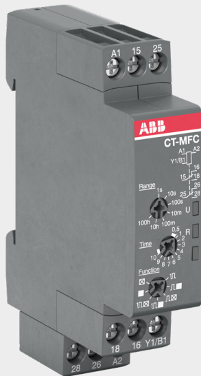
ABB time relays provide simple, reliable and economical control solutions in all types of panels. They are typically used in industrial applications and OEM equipment, providing time-delayed switching to start a motor, control a load or manage a process.

The CT-C range combines lower cost with higher value and performance by offering essential functions in a 17.5 mm housing, freeing up room in any control cabinet. The range includes 14 devices, offering both single and multi-functional types, with a time range from 0.05 seconds to 100 hours. Equipped with wide voltage ranges, CT-C time relays allow for use across a huge variety of applications worldwide.