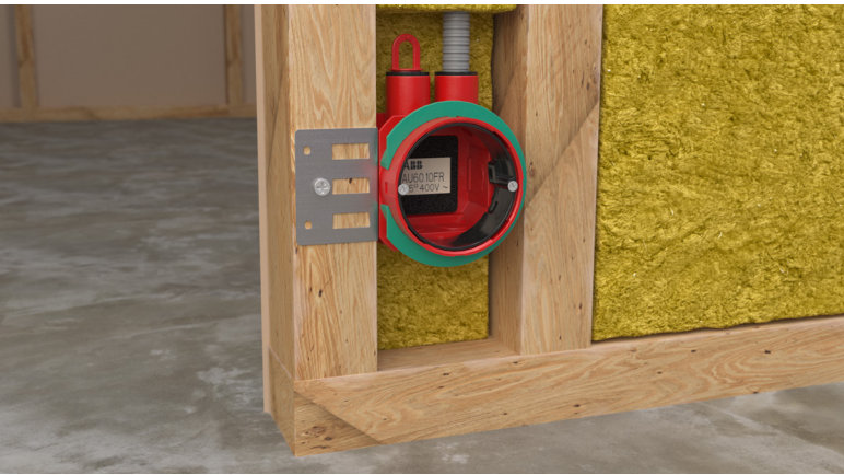
01 Installation with a truss fixture