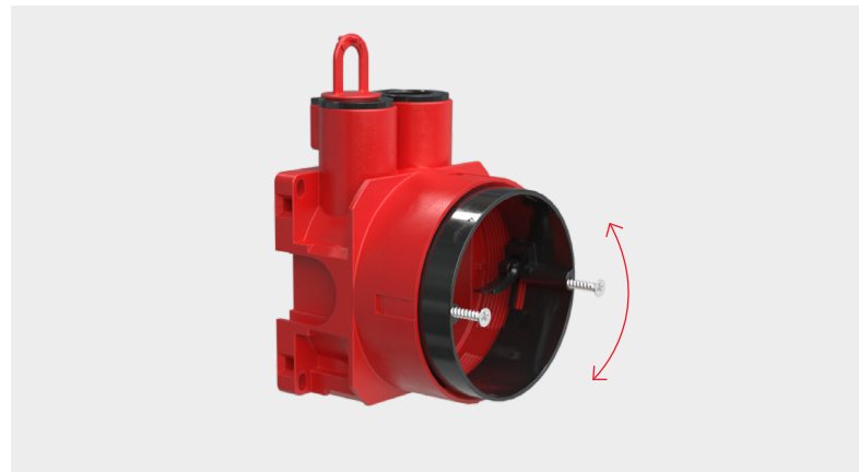
04 An optimal height for the top surface of the box is achieved by using the adjustable installation ring. This allows the device to be installed parallel with the wall's outer surface.