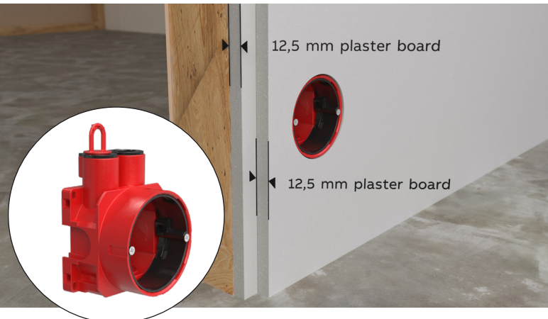
03 Installation in EI60 walls: The EI60 structure is achieved with a double layer of plasterboard (when using special plasterboard, the structure can also be achieved with a single layer). With a double layer of plasterboard, the green extension ring is removed from the box.