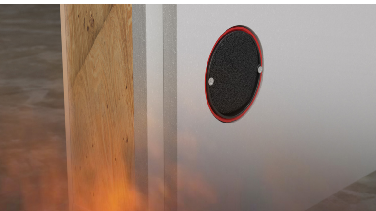
05 In the event of a fire, the fire cushion at the bottom of the box expands, filling the entire box and sealing the hole in the wall. This prevents the fire from spreading to the wall structures.

ABB Oy P.O. Box 16 (Porvoon Sisäkehä 2) FI-06101 Porvoo, Finland Tel. +358 10 22 11