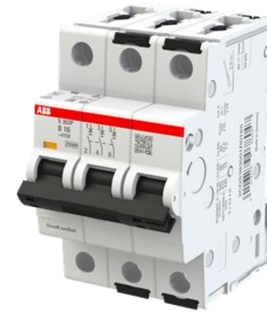
ABB Eco Solutions™

Fully compatible with the existing ABB System pro M compact accessories, the S300 P ensures reliable protection in demanding applications such as commercial buildings, data centers, industrial applications and e-mobility.