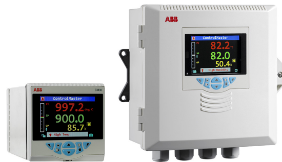
ControlMaster controller range

With their full-color, TFT displays, all controllers in the ControlMaster range provide operators with a clear and comprehensive overview of process status and key information. These displays can be tailored to show specific process data, while a chart display provides short-term trending information.