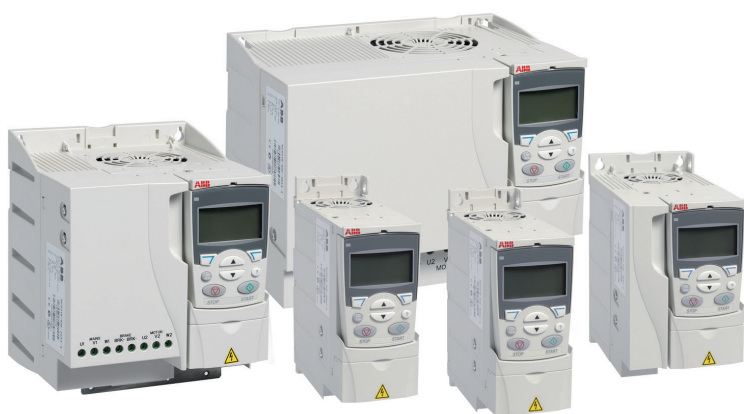
ABB general purpose drives, ACS310, are dedicated to variable torque applications such as booster pumps and centrifugal fans.

The drive design includes a powerful set of features which benefit pump and fan applications including built-in PID controllers and PFC (pump and fan control) that varies the drive's performance in response to changes in pressure, flow or other external data. The drives also have pre-programmed protection functions such as pipe cleaning for preventive maintenance.