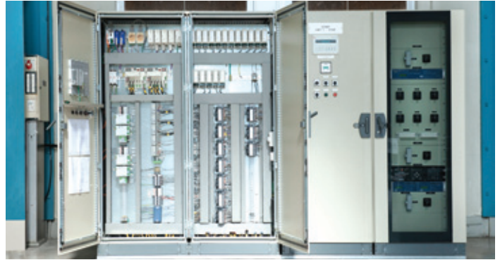
1 The Tokaanu Power Station and control centre, located on the slopes of Mount Tihia in New Zealand's central North Island. | 2 Motor control centre including ABB variable speed drives. | 3 New generator control panel.

The Multisystem integration between the Tokaanu station and the provider systems at Rangipo and Waikaremoana are provided by redundant system servers connected on redundant communications links.