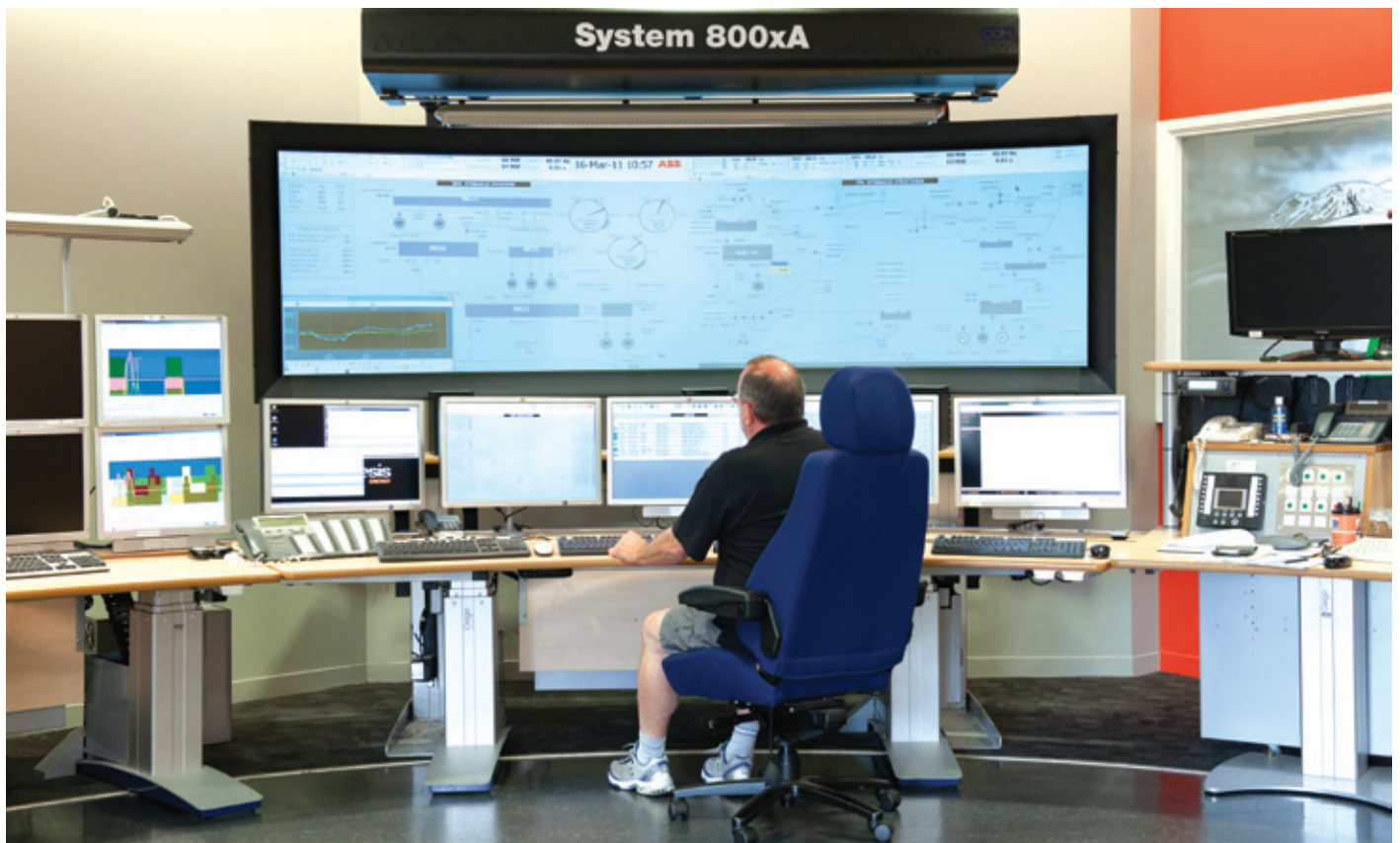
Tokaanu control centre featuring Extended Operator Workplace (EOW).