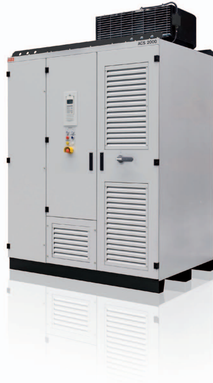
ABB offers significant additional advantages. The ACS 2000 uses much of the technology employed in ABB low voltage drives, integrating and operating with the same control panel and using the same methods of communication and diagnostics. It does not require the motor and cables to be changed, and is therefore a perfect fit for installations into existing environments.