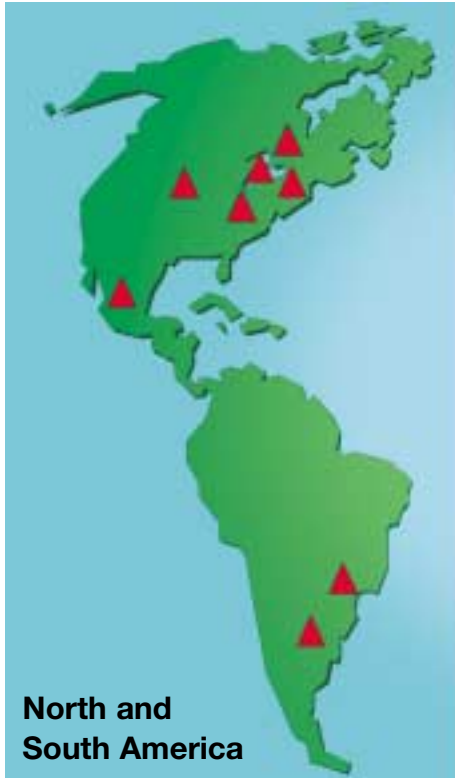
ABB Flexible Automation can significantly improve your manufacturing process through our extensive range of products, systems and service solutions.