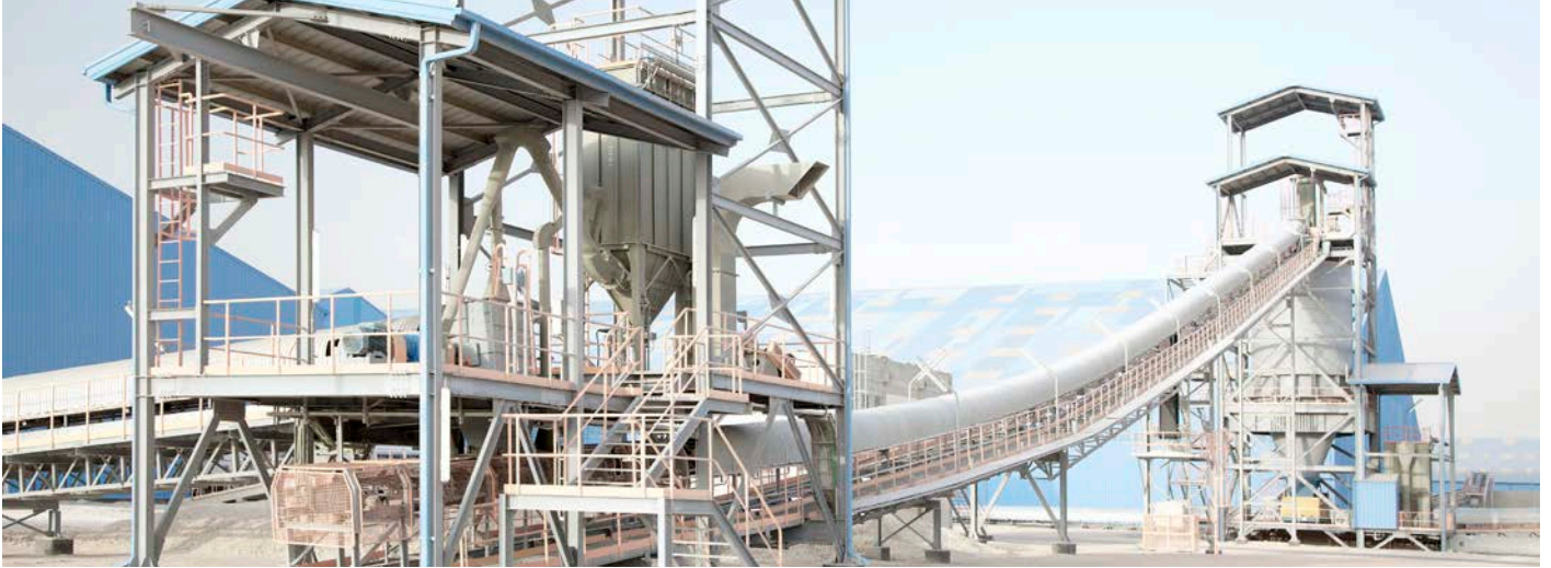
ABB LST series meet your needs to measure corrosive liquids, dusty bulk solids or anything in between.

Ultrasonic level technology provides the best performance for liquid level and short range bulk solid level applications. Advances in ultrasonic technology over the last decade has made many measurements possible and even easy, which were previously not possible using the technology. ABB's ultrasonic level transmitters lead the way in the water industry in many ways.