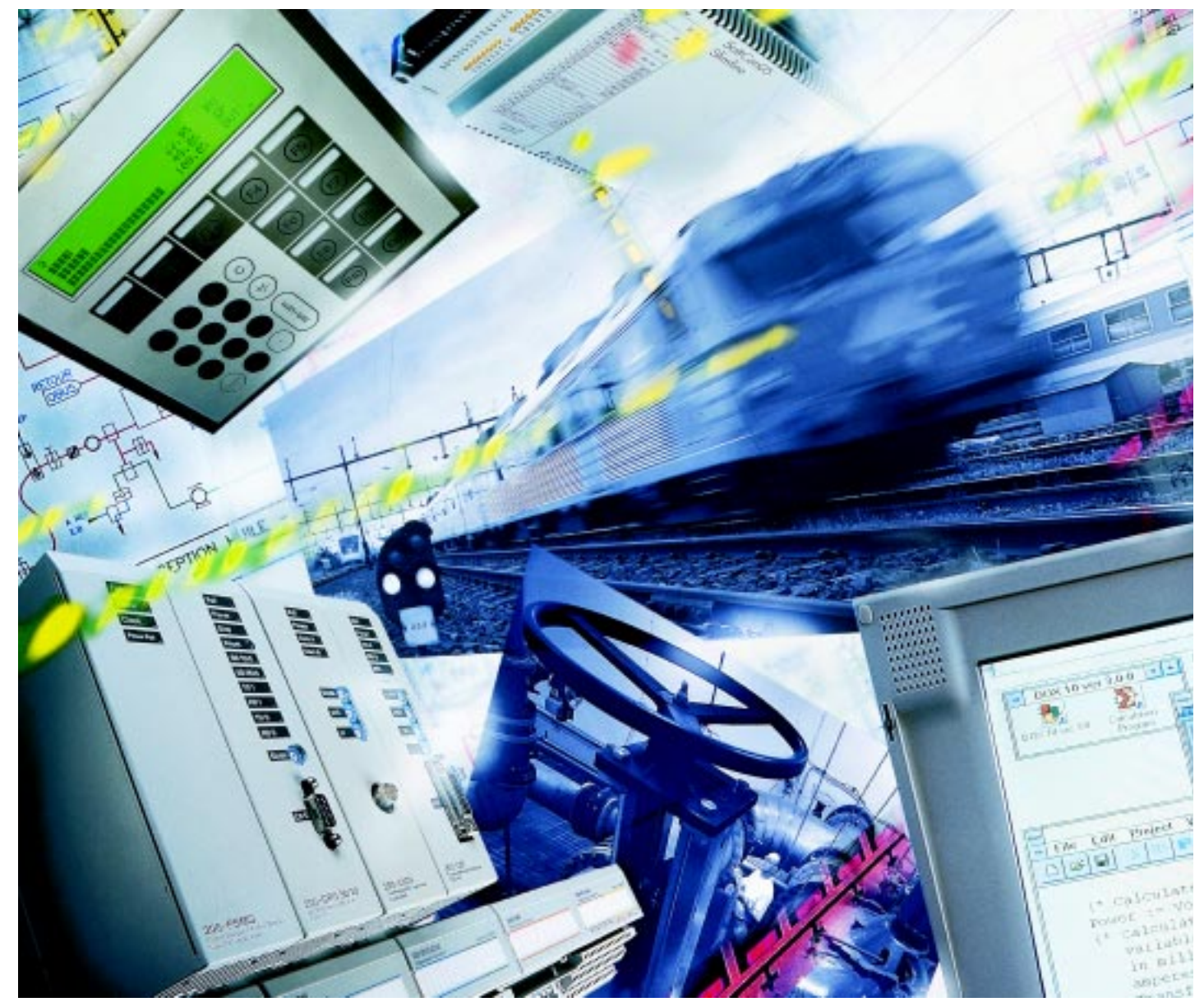
SattCon 200 • SattCon 05 • SattCon OP45 • DOX 10