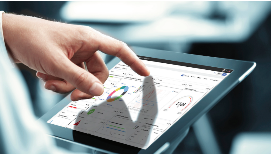
ABB Ability™ Manufacturing Operations Management Dashboard Application

Today industries have large amounts of data collected in different systems. This data is essential for industries to keep track of their performance. The ability to search, find, view and analyze this data in different context and time frames are key to turning it into actionable knowledge and decisions.