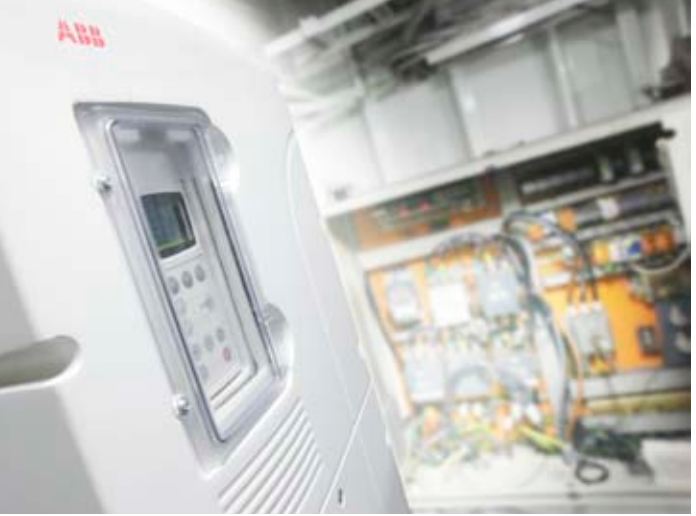
Rope tension is maintained automatically using time control sequences without a load cell sensor.