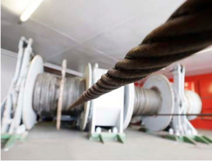
The existing motor, motor cable, mechanical disc brake and operator control stand were reused.