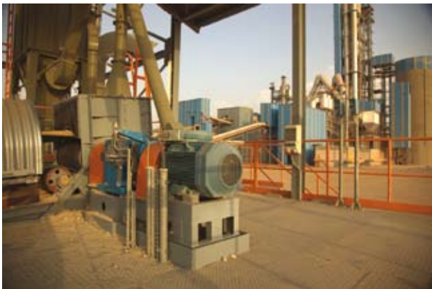
Figure 2. Drive system for conveyor.