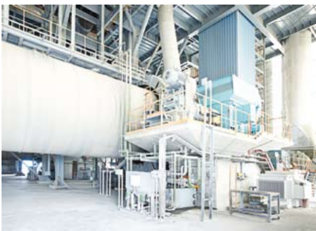
Figure 4. Cement mill.