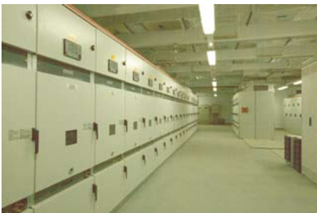
Figure 3. Main station MV switchgear.