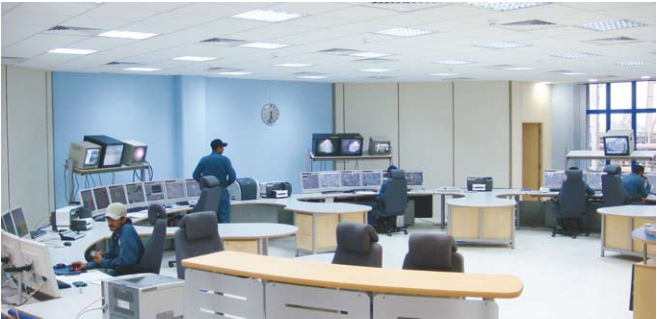
Figure 5. Control room.