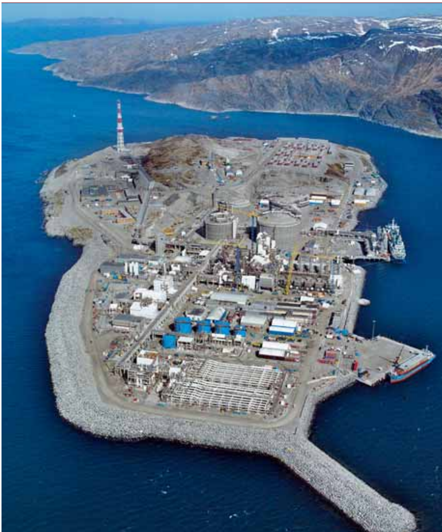
3 Overview of the liquefied natural gas factory on Melkøya, northern Norway

The ECSS is at the heart of the electro system and communicates with the vast range of equipment using serial links and Ethernet. It is also linked with the automation system and third-party deliveries. The system consists of 48 AC800M controllers. With more than 43,000 signals being processed at any one time, the ECSS provides a wide range of functions, enabling stable power to be supplied to the LNG facility.