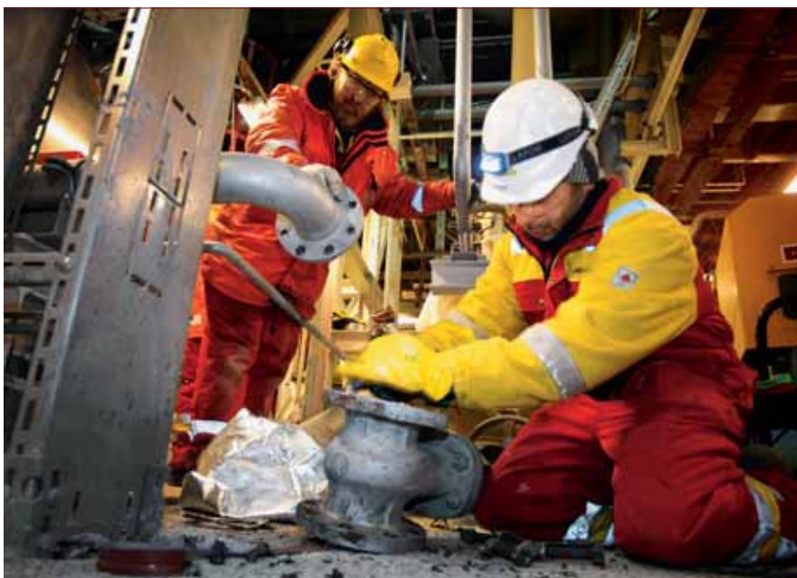
Process maintenance

"We are proud of what we have achieved in such a short time and we are sure that Statoil once again will be pleased with our deliveries", concludes Riple.