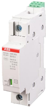
OVR BT2 20-75 P