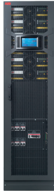
ABB Power Protection SA Via Luserte Sud 9 6572 Quartino, Switzerland

We reserve the right to make technical changes or modify the contents of this document without prior notice. With regard to purchase orders, the agreed particulars shall prevail. ABB AG does not accept any responsibility whatsoever for potential errors or possible lack of information in this document.