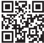
ABB Ability™ Smart Sensor for mounted bearings