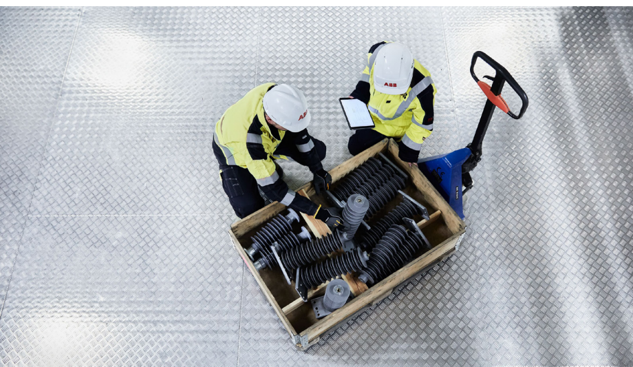
ABB Electrification — Emergency Response Frequently Asked Questions

Let our service, repair, and manufacturing teams help get your facility back up and running.