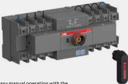
01 Easy manual operation with the handle in case of emergency