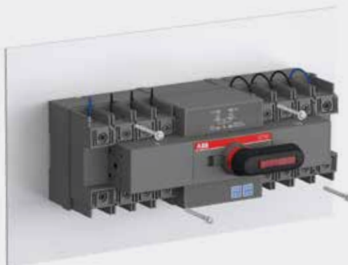
03 Base mounting with screws