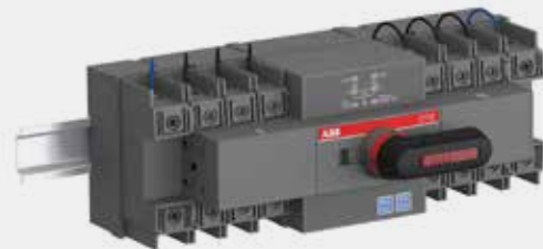
02 DIN- rail mounting