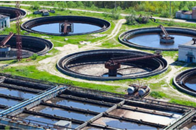
Harness these benefits of digitalization