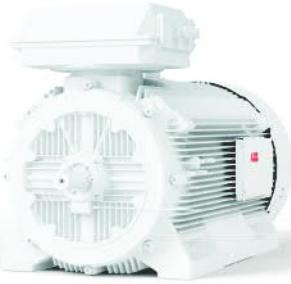
Figure 1: Motors fitted with ABB Ability™ Smart Sensors

An optimal solution is to leverage secure, robust IT infrastructure that is already deployed in a plant to capture machine status from OT sensors. A dual-use IT/OT network is more economical and has the advantage of eliminating the need for dedicated gateways.