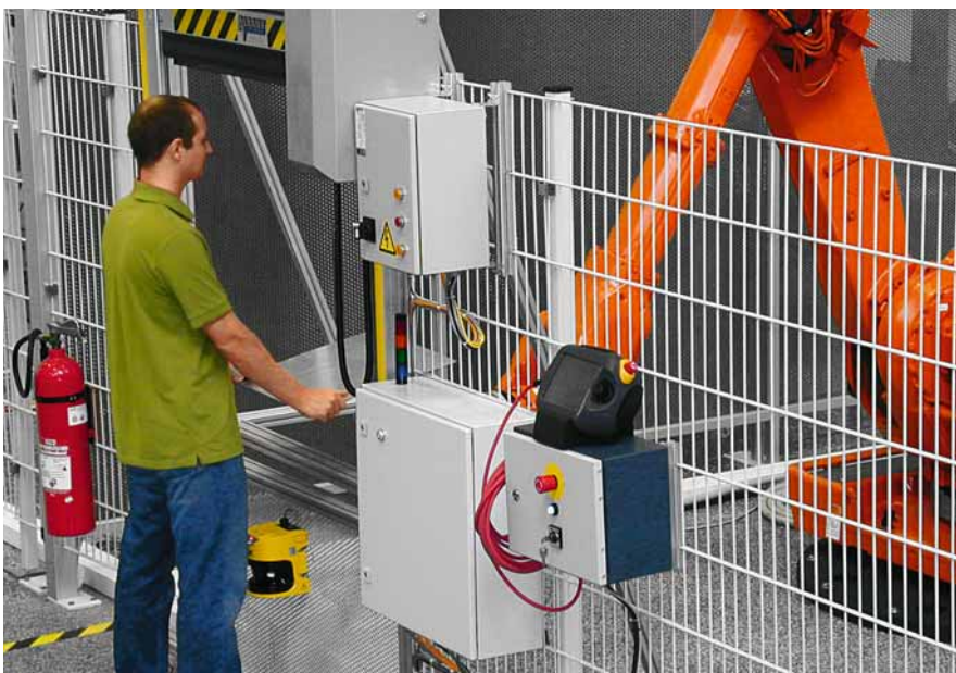
ABB is working with partners and end users on new flexible manufacturing concepts to convert the technological advantages provided by applications like SafeMove into cost savings for the customers' operations. While the market is embracing these new possibilities, ABB's researchers and developers are already thinking about what will come next.

ABB is working to convert the technological advantages into cost savings.