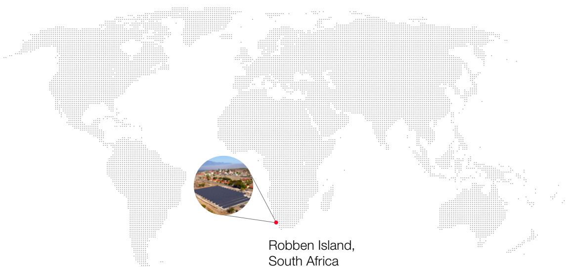
Robben Island, South Africa