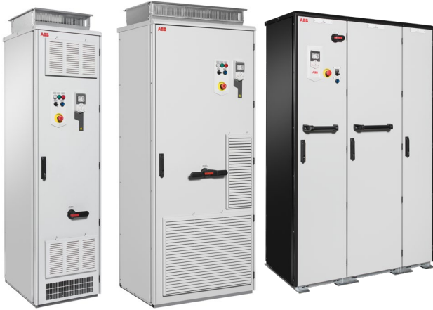
ABB ACS580 general purpose cabinet-built drives for auxiliary application and ACS880 industrial drives for heavy applications in chemical and petrochemical industries.