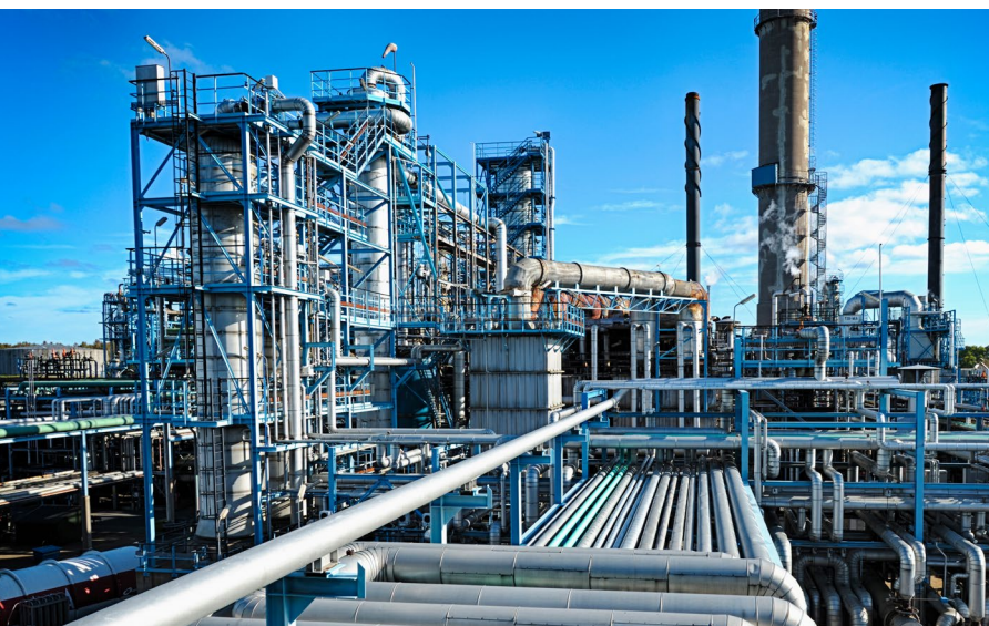
ABB has been operating in chemical and petrochemical industries for decades, supplying LV and MV drives for process control in numerous projects worldwide.

Providing safety and uptime for auxiliary applications in chemical and petrochemical industries