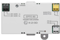
CPTC-02 ATEX certified thermistor protection module, EX II (2) GD

Learn more about ABB offering for oil and gas industry from: