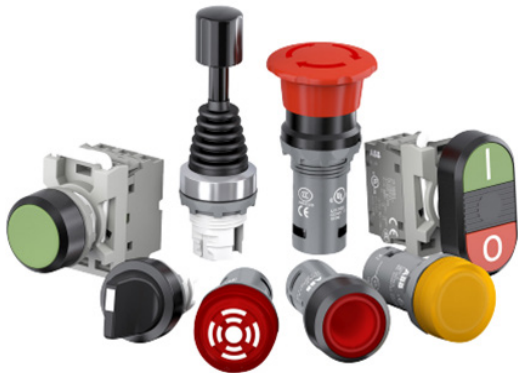
ABB pilot devices are engineered for total reliability. Our products are tested to extremes and proven in the toughest environments. Their innovative design simplifies the entire process, from selection to installation. Enclosures, signal towers and signal beacons complete the portfolio.