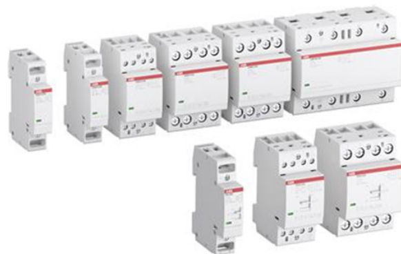
ABB installation contactors are suitable for household appliances according to the IEC 61095

“Electromechanical contactors for household and similar purposes” standard and can therefore also be used in many household appliances. Similar to EC 60335-1, IEC 61095 references to the same glow wires tests specified in IEC 60695.