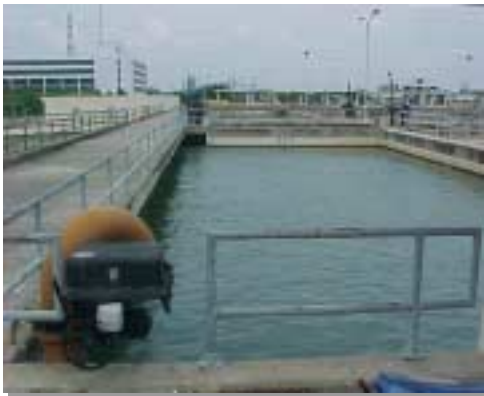
The water treatment plant for main water supply in Bangkok