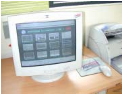
Human system interface for monitoring and control make more easy working for the operators

Control IT AC 800F and S800 I/O changes the ways for operators to operate the filtering process control. The Water Treatment Plant of Metropolitan Water Authority Bangkok, Thailand was established in 1979. It's processes have been controlled by Human with only manual operation. Now, ABB Control IT is the next way for their control system.