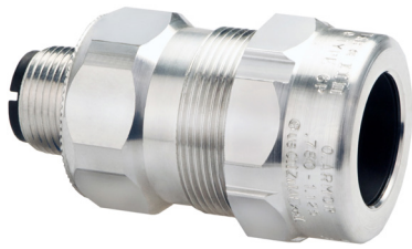
ABB cable glands – STE Star Teck® extreme series Industrial applications

The STAR TECK® STE fitting for Teck, MC and ACWU - its innovative design provides quality engineering, easier installation and helps achieve safer, more reliable terminations in challenging industrial environments. The STE offers a broader cable range per fitting compared to the regular ST series.