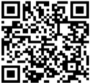
ABB is dedicated to advancing sustainability through comprehensive Life Cycle Assessments (LCA), third-party verified Environmental Product Declarations (EPDs), and a circularity-focused evaluation of its product portfolio. LCA provides a holistic view of a product's environmental impact across its entire life cycle, from raw material extraction and manufacturing to transportation, usage, and end-of-life. These assessments support the creation of transparent EPDs, identify opportunities for environmental performance improvements, and guide strategic planning for a circularity approach.